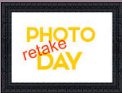
PHOTO RETAKES will be on